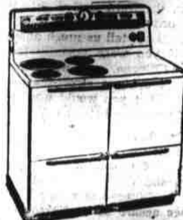
"G-E" Automatic Electric Range Southernland Electric Co

Eyes Examined, Glasses Fitted. Next Door To Caveness Chevrolet Company Permanent Office in WAREHOUSES