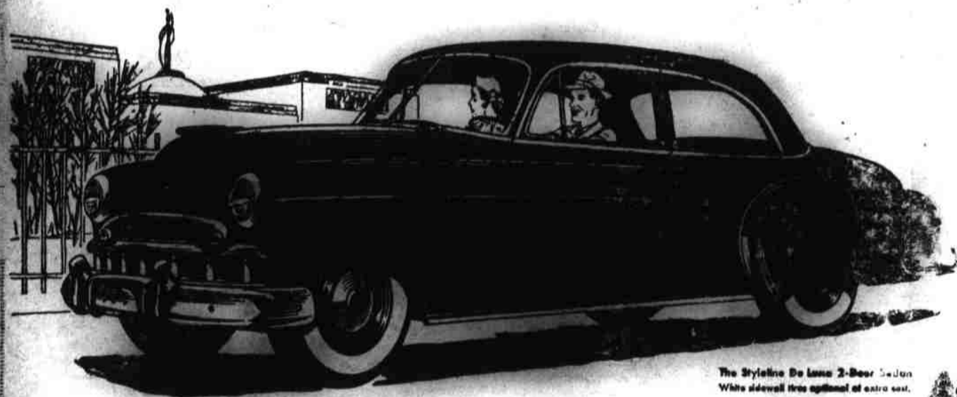
The Styline Buick 2-Door Sedan White adobe trim optional at extra cost.

Your first thrill is seeing it... Your greatest thrill is driving it!