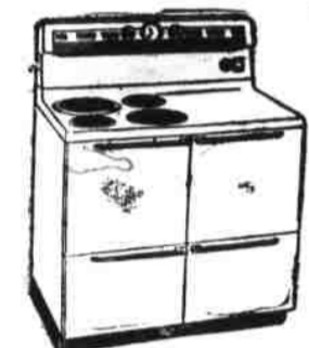
"G-E" Automatic Electric Range Southerland Electric Co Warsaw, N. C. Phone 301-1 Your (G. E.) Dealer SALES & SERVICE All Types Of Wiring

WHEN YOU NEED SERVICES OF AN AUCTIONEER CALL