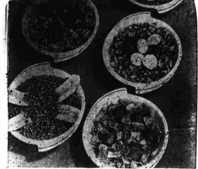
SUMMER MEDLEY OF FRUITS AND CEREALS What could be more appealing to lure the lagging appetites on a hot day than luscious fruit with crisp, crunchy cereal?

Editorial in Wilmington Morning Star, July 18, 1949 "The Story of Duplin"