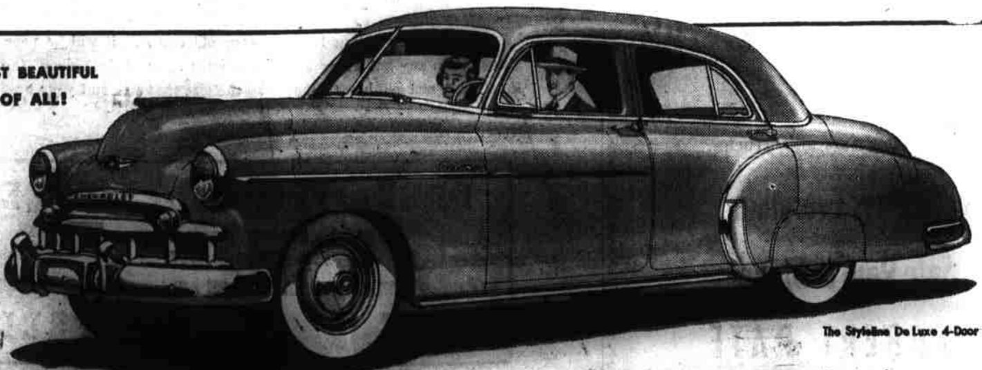
The Styline De Luxe 4-Door Sedan

Jones Chevrolet Company Pink Hill, N. C.