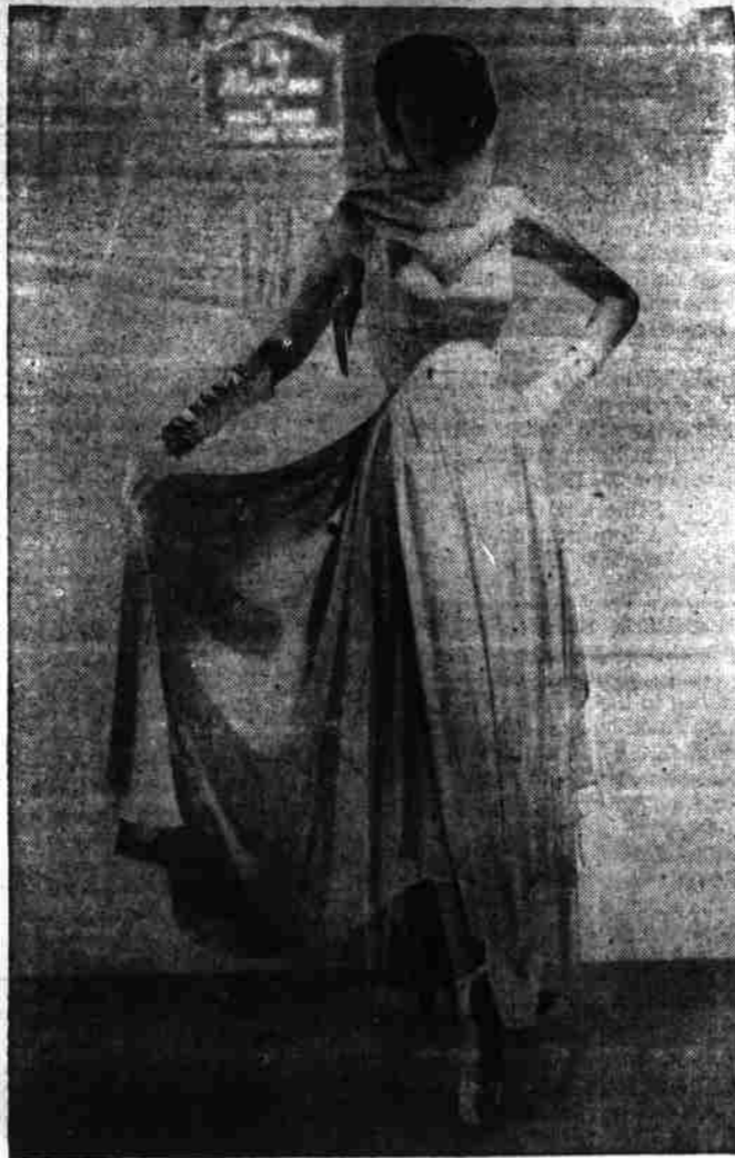
Here's a formal dress that will make any evening enchanting. It has a fitted, lace bodice, a floating skirt of Celanese Chifonese, and a matching scarf stole. A David Klein original, the gown was selected by Cosmopolitan magazine's fashion editor as part of a cruise wardrobe. Available colors are white, blue, pink and yellow and the price—about $30.