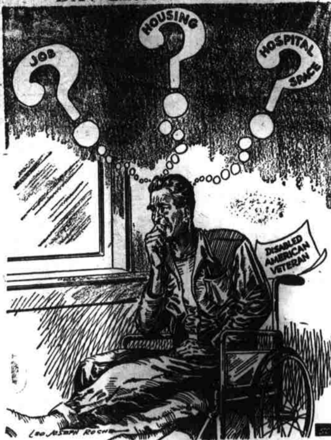
CINCINNATI—Thought provoking cartoon by Leo Joseph Roche of the Buffalo Courier Express depicting the problems of the war disabled veteran is declared best in 1949 competition sponsored by the Disabled American Veterans among editorial newspaper cartoonists.