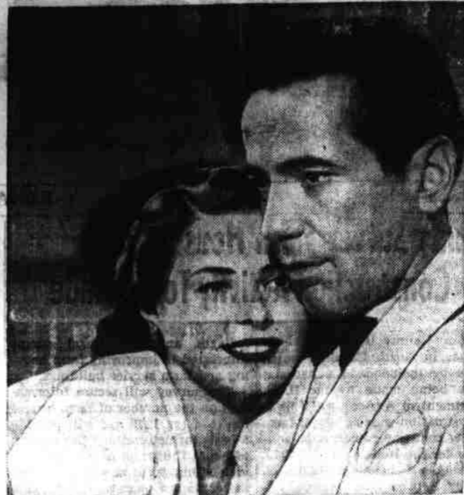
HUMPHREY BOGART and INGRID BERGMAN in Warners Bros.' smash romantic drama, "Casablanca," which shows at the Capital in Kenansville next Wednesday.