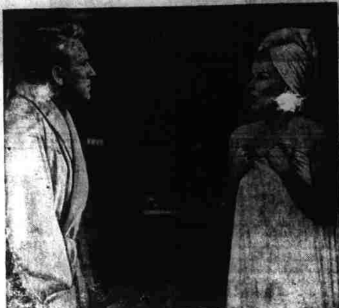
Assistant District Attorney Spencer Tracy and his lawyer wife, Katherine Hepburn, do some extra-curricular arguing in this domestic scene from "Adam's Rib," M-G-M's hilarious comedy showing at the Capital Theatre here next Monday and Tuesday. Judy ("Born Yesterday") Holliday, Tom Ewell, David Wayne and Jean Hagen, recruited from the Broadway stage, are also featured in the laugh hit, directed by George Cukor.

A LETTER Dear Friend:- I want to tell you briefly of a great new motion picture which Mr.