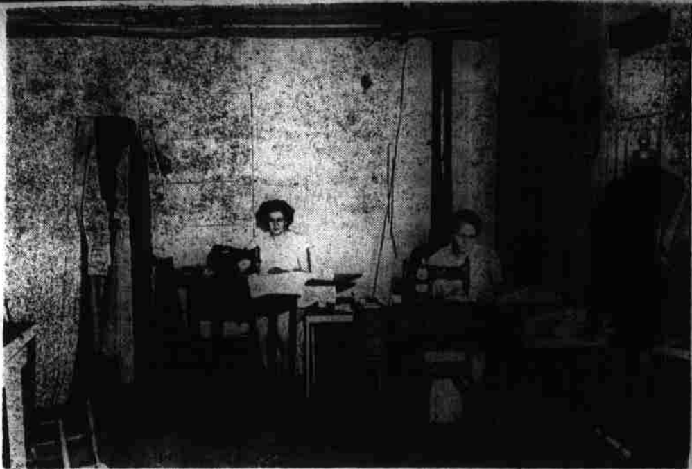
Home Demonstration Women Supplement Their Income by Putting Into Practice Good Methods of Sewing.