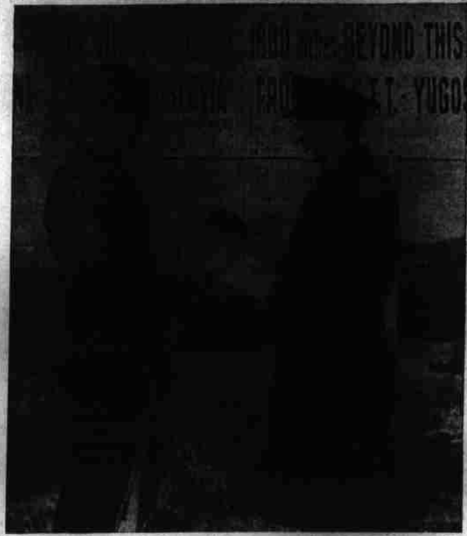
Trieste—Wherever U. S. armed forces serve, the Red Cross is with them. Here on the border of the Free Territory of Trieste, a Red Cross field director discusses a communication with a member of the 351st Infantry.

A. Pelleted seeds are those which are literally wrapped in balls of clay. They result in more uniform spacing of plants, reduce thinning costs by about one-half, eliminating the cost of growing and transplanting plants, and produce a more uniform crop.