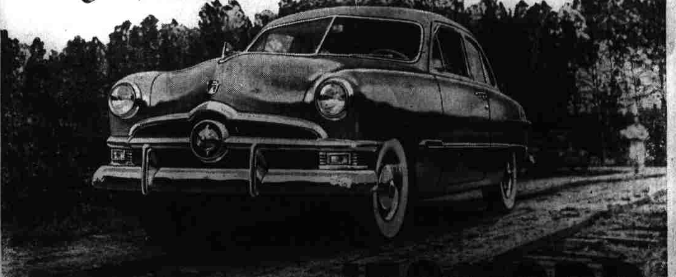
White shown here available at extra cost.

"TEST DRIVE" THE ONE FINE CAR IN THE LOW-PRICE FIELD!