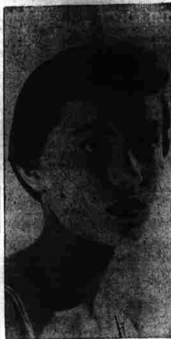
The girl with the round face should avoid wide collars and definitely circular curls which accentuate roundness. Here's a hair-do designed for her. It's a simple, brief cut with smart, smooth crown. Hair is combed flat across the head; the ends are fluted up to give height. In back, the hair is lightly waved and ends in an upturning, girlish fringe. This style is from the Master Book of 50 New Hairdos, featured in the March issue of Good Housekeeping.