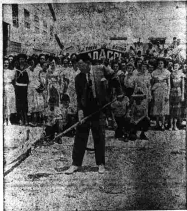
Senator Dudley J. LeBlanc, creator of famous HADACOL is shown above breaking ground for the new HADACOL factory now being built alongside the present plant in Lafayette, Louisiana. This new building will be 80x235 feet, two stories, steel and concrete construction. The remarkable growth of HADACOL has forced the immediate construction of this new building. Only last spring Senator LeBlanc opened the present HADACOL plant and now less than a year later, HADACOL requires a 100% increase in factory space.