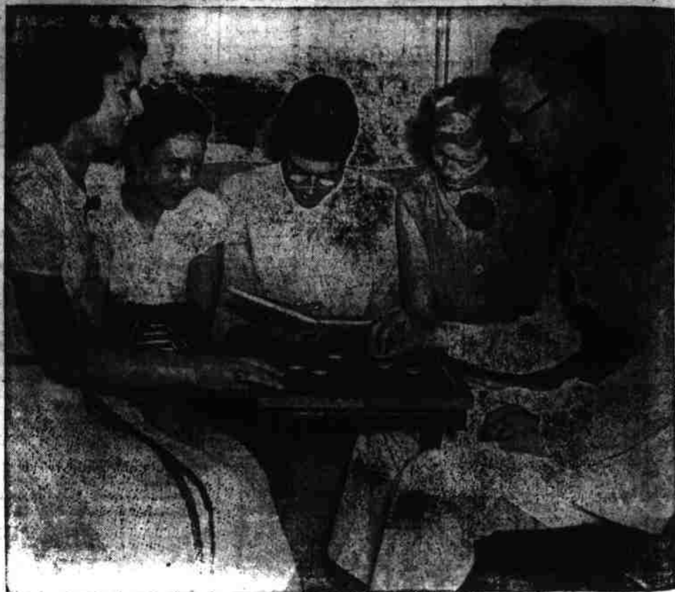
What to do on a rainy afternoon is solved by above Summer School students of Pineland College-Edwards Military Institute, Salemburg. Involved in a checker game