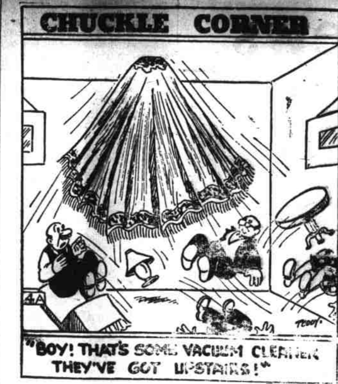
"BOY! THAT'S SOME VACUUM CLEANER THEY'VE GOT UPSTAIRS!"