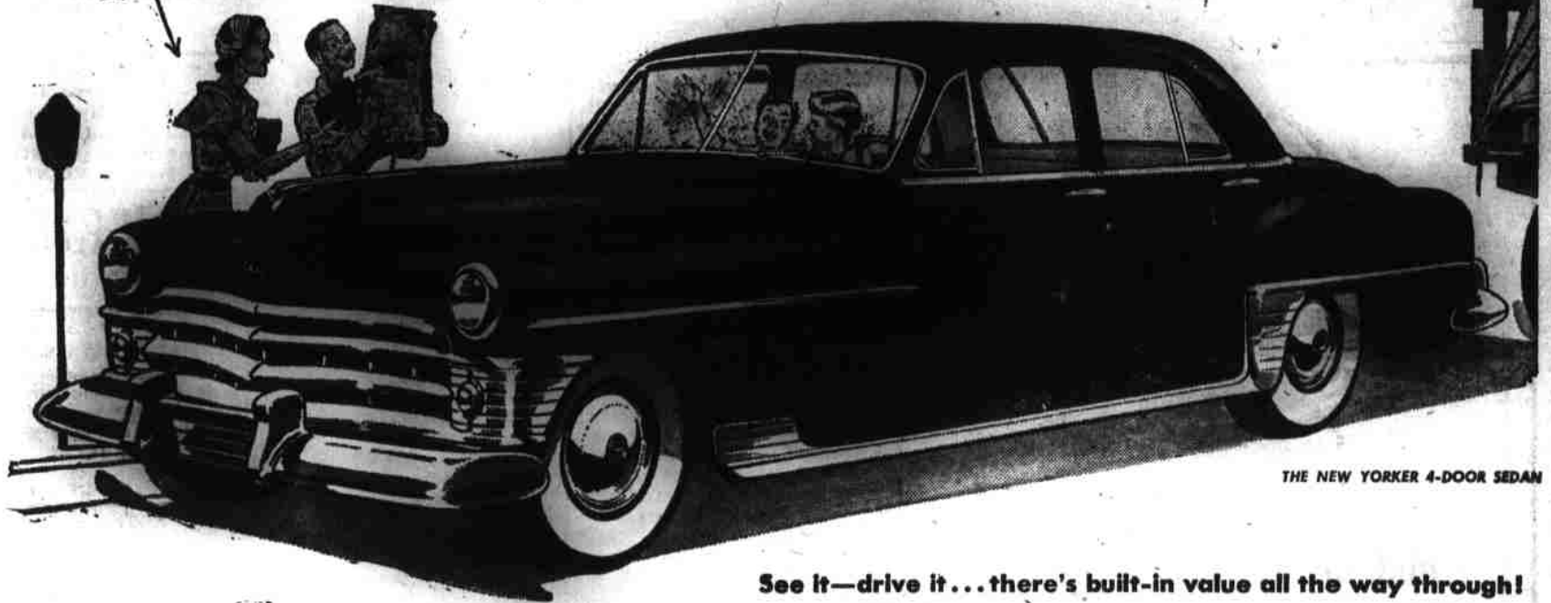
THE NEW YORKER 4-DOOR SEDAN

See it—drive it . . . there's built-in value all the way through!