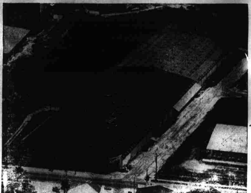
AERIAL VIEW NEW PLANTERS WAREHOUSE No. 2

The Greatest Sales ORGANIZATION in the World Will Operate