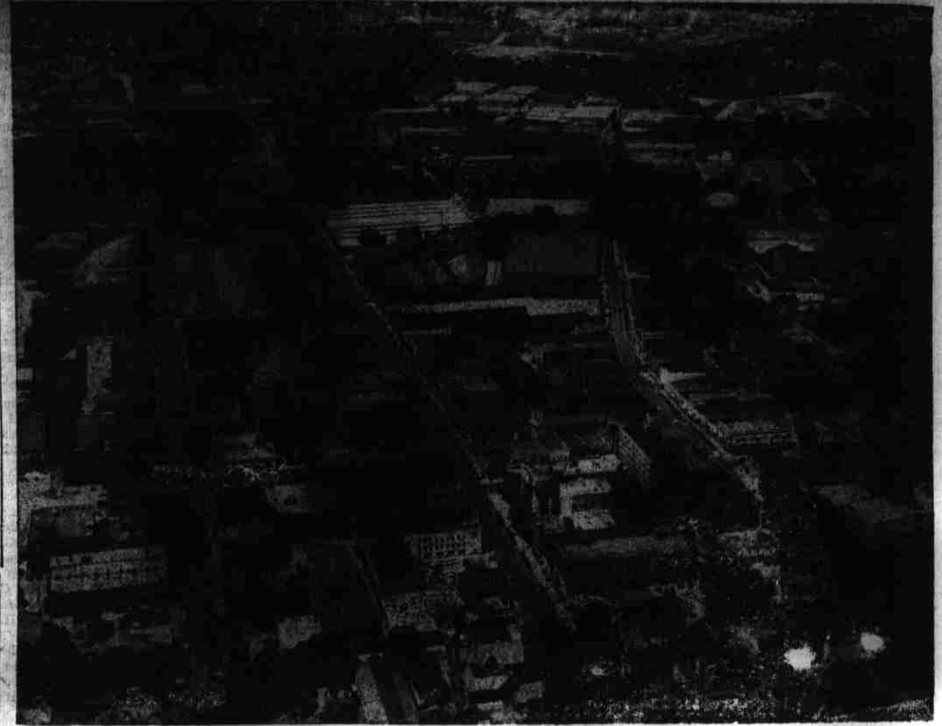
AERIAL VIEW OF WILSON — showing a part of the fast-growing Eastern Carolina town's business district and some of its warehouses. The town, known as the world's largest tobacco market, will be humming with activity when auctions are resumed on August 21.

How time flies. Just a few years back you were thrilled with the "ole swimmin' hole," ready to take a plunge into its cool, flowing waters. Maybe ten years from now you'll want to take another plunge such as buying a new home, a new car, a long vacation trip. These take money and where's it coming from. The smart people know the easy answer—U. S. Savings Bonds. Enroll now for the Payroll Savings Plan where you work, or if self-employed, the Bond-A-Month Plan at your bank. You then save automatically and in 1960 your Savings Bonds will produce $4 for every $3 invested today.