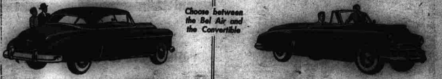
Choose between the Bel Air and the Convertible