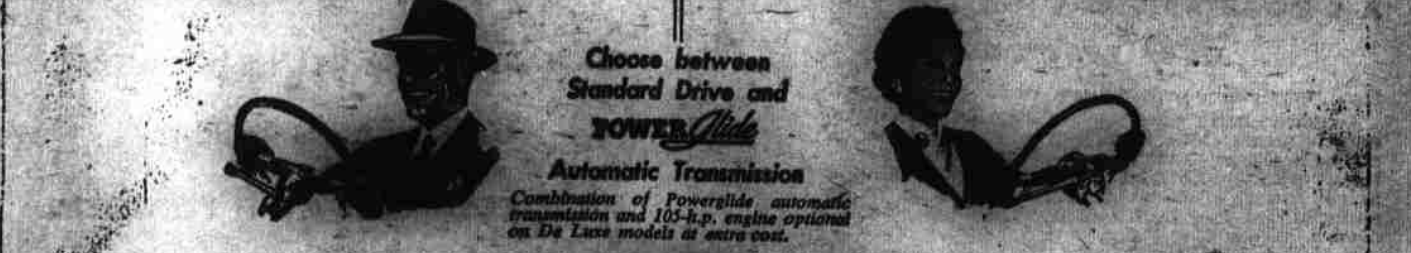
Choose between Standard Drive and POWERGLIDE