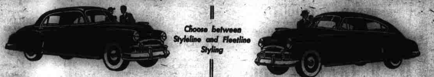
Choose between Styline and Fleetline Styling

North Carolina Division UNITED STATES BREWERS FOUNDATION, INC.