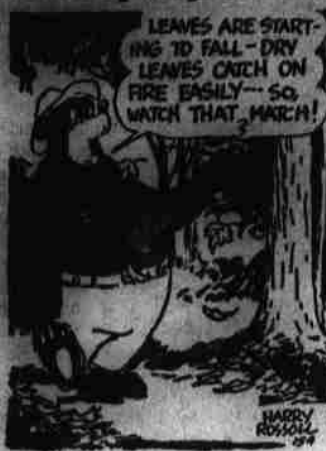
Fall Season is the dangerous time in the woods — especially if you're smoking.