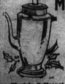
Electric Coffeepot For Making Excellent Coffee

There's No Doubt! The Gift That's Sure To Please Is An Electrical Gift . . .