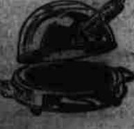
ELECTRIC BROILER With Dome Top Makes Tasting Meats In Less Time