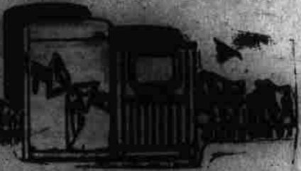
Will Give Pleasure For A Long Time