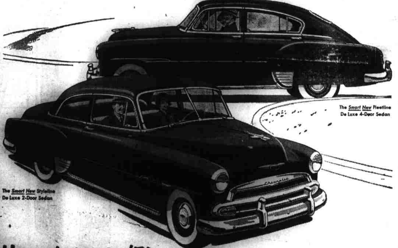
The Smart New Styleline De Luxe 2-Door Sedan

AMERICA'S LARGEST AND FINEST LOW-PRICED CAR!