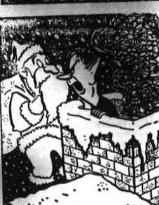
"What kept ye, Whiskers?"

Our "policy is the best policy", so don't delay — come in today for complete, expert advice on your needs.