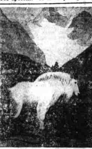
Mountain Goat ©1932 National Wildlife Federation

The mountain goat is living proof that American sportsmen are good sports, says the National Wildlife Federation. This likable Old Man of the Mountain is a relatively easy target for modern high powered rifles with telescopic sights, yet there are nearly as many today as there were in early times. Modern hunters want hard to get trophies. Furthermore, outdoorsmen and mountaineers have developed a great admiration for the courage of the white goat. It never runs from sudden danger, but trots off with solemn dignity. Its bearing, white hair and chin whiskers command respect. It is no pugnacious, but will fight for a mate and stand its ground to the death when need be to defend itself or its young. With dagger like horns it has held its own against a pack of wolves, hunting dogs or even the ferocious grizzly bear. Mountain goats are comparatively abundant in British Columbia, and their territory extends south into Washington, Idaho, Montana, and north through the Yukon into Alaska. They dwell by choice high