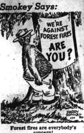
Forest fires are everybody's concern!