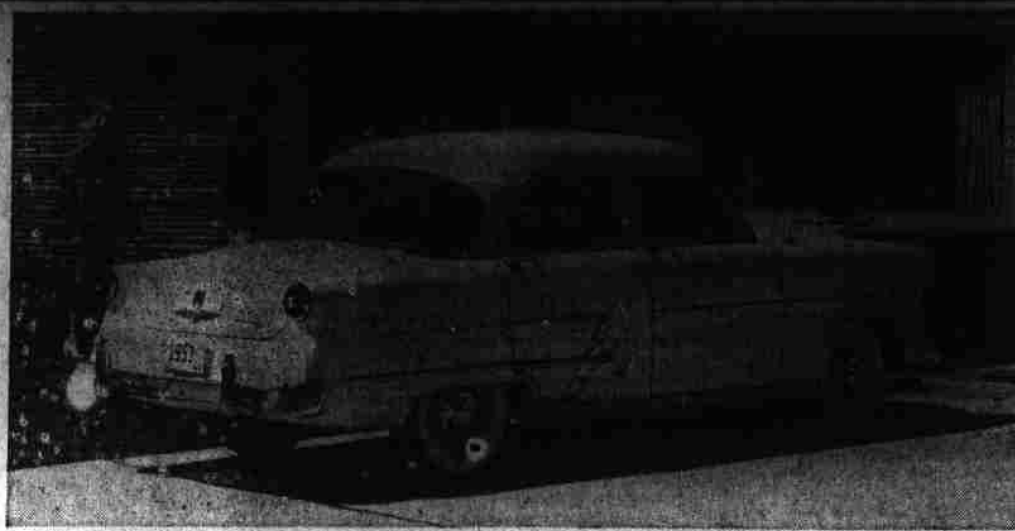
Smart, sleek lines accentuated by new jet-tube taillights and a new chrome molding through the center of the rear fender line are featured in the 1933 Ford Customline Fordor sedan. Outstanding mechanical feature is a new "miracle ride" which brings to the high volume field for the first time the smooth riding characteristics of a heavier, costlier car.