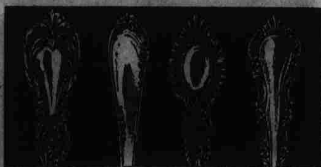
Reed & Barton