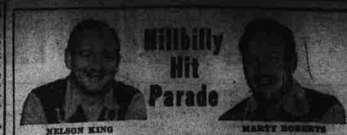
The top ten tunes of the week as selected from your cards and letters