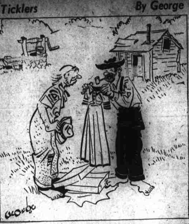
"Paw, I've been gypped! The catalog had a purty girl in it!"