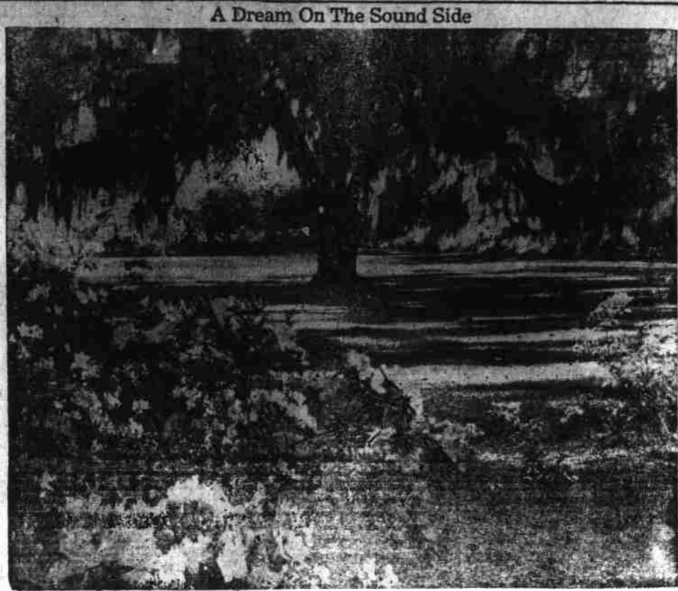
An old anti-Bellum estate located on the sound near Wrightsville. The grounds are a virtual carpet of green under huge state