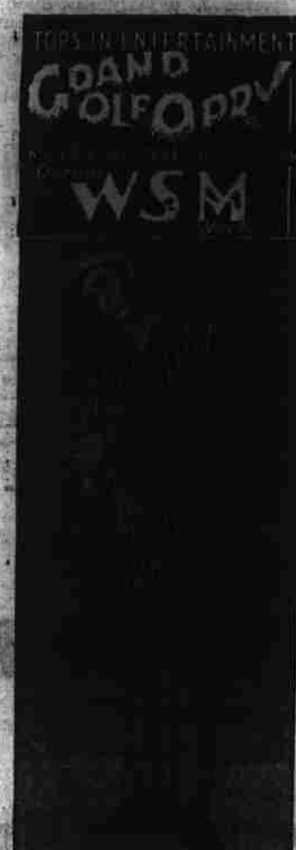
★ STRING BEAN ★ THE KENTUCKY WONDER

FRIDAY, SEPTEMBER 4th. Kenan Memorial Auditorium IN KENANSVILLE