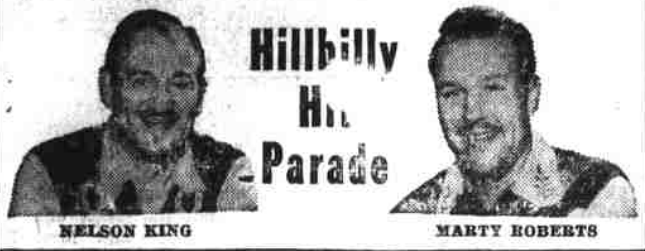
The top ten tunes of the week as selected from your cards and letters

The featured stars, including European and American artists, are Sickel, celebrated star of Moulin Rouge and Bal Tabarin of Paris; Larry Griswold, comic diving art-