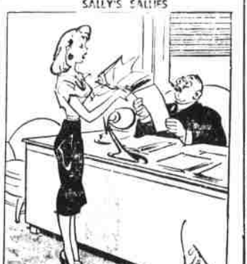
"Why shouldn't the spelling be bad? All we have in this office is a worn-out old dictionary!"