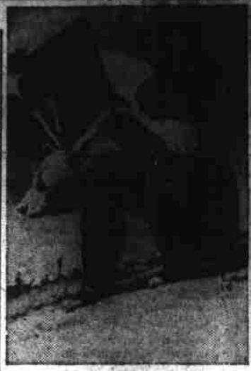
GRIZZLY BEAR