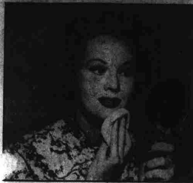
As final check on the smoothness of her make-up, actress Virginia Mayo makes use of a magnifying mirror. It's also a reliable measure of her skin care.

And finally, it's the last word on the smoothness of your make-up, telling you if you've worked well and with an expert hand.