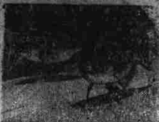
LONG-EARED SUNFISH

people by supplying information about available specialized boarding home care in licensed homes. This program recognizes the fact that many older people who are on their own need a kind of housing arrangement that affords companionship, personal attention, and service short of actual nursing care. In general these boarding homes are licensed by the State Board of Public Welfare for a small number of older persons in order to assure a home-like atmosphere. The services given mean that the older person has not only a comfortable place to live, but also a satisfying social setting. In North Carolina there are 250 licensed boarding homes for the aged and infirm. Of these homes, 75 per cent are for white persons and 25 per cent for Negroes. Licensing requirements set up by the State Board of Public Welfare, in accordance with State Law, include satisfactory standards of health, sanitation, fire safety, and general welfare. Most every man knows his own business, but it is often difficult to make his neighbors believe it.