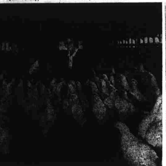
Here they are shown with a portion of their flock, which will soon be marketed.