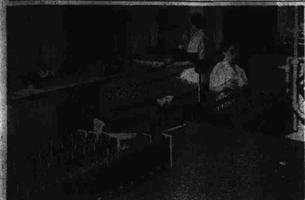
Laboratory technicians in Raleigh test soil samples and give farmers in the community valuable information about their land.