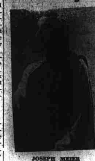
As The Christus

WILMINGTON - The renowned Original Black Hills Passion Play, which reconstructs faithfully the dramatic events of the last seven days in the life of Christ on earth. will be presented in Wilmington on October 16, 17, 18 and 19.