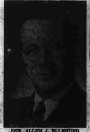
SEN. ALLEN J. ELLENDER