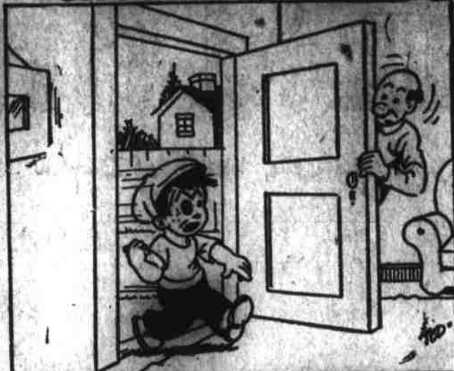
"DON'T WORRY...WILLIE'S POP WON'T BE 'AROUND'! I LICKED HIM, TOO!"