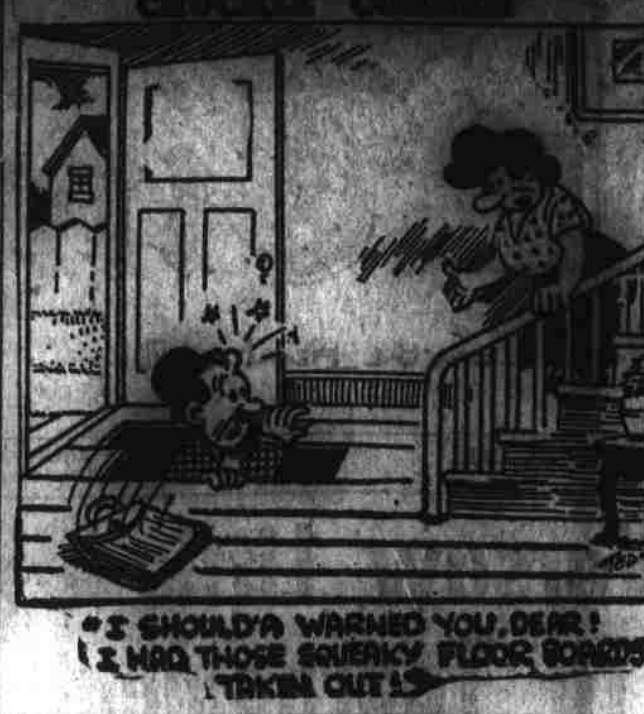
YOU SHOULD'A WARNED YOU, DEAR! I HAD THOSE SNEAKY FLOOR BOARDS TAKEN OUT!