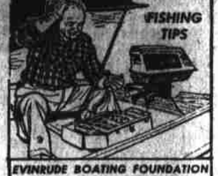
EVINRUDE BOATING FOUNDATION