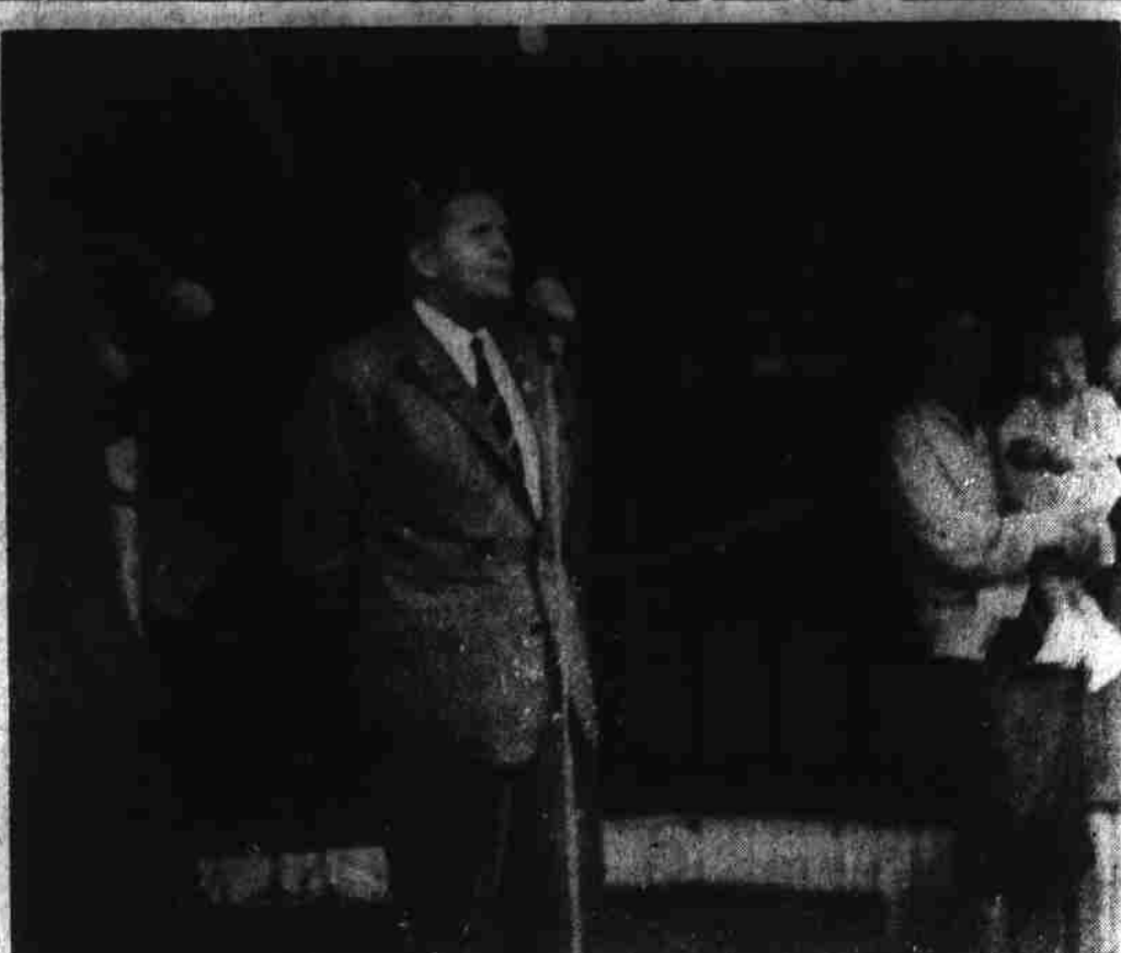
TERRY SANFORD, DEMOCRATIC NOMINEE FOR GOVERNOR, in front of Democratic headquarters in Rose Hill. Sanford officially opened headquarters in Rose Hill on Monday when he visited Duplin County for a stop in Warsaw, Rally in Kenansville and luncheon in Wallace. Ladies of Rose Hill served coffee and cookies to guest present, and distributed Kennedy-Johnson and Sanford literature.

This Great America was not built by men who were satisfied to stand still. It was built by men who were wanting to see the Nation on the move forward. Mr. Nixon says "we have never had it so good." Mr. Kennedy said, "There is a better America and a stronger America awaiting us provided we want to work for it." A great deal has been said about Mr. Kennedy being a Catholic. This newspaper believes in God as the supreme being of the universe. It also is a firm believer in Jesus Christ, in which the Catholics also believe. This newspaper also believes in the entire Constitution of the United States. It says in the Constitution of the United States.