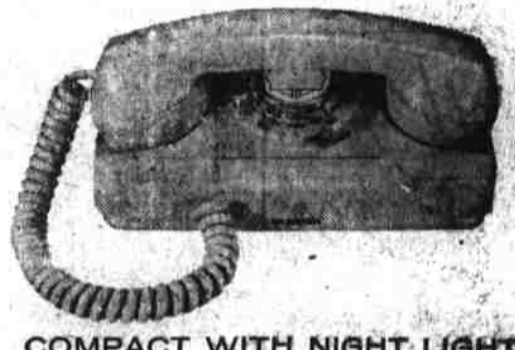
COMPACT WITH NIGHT LIGHT