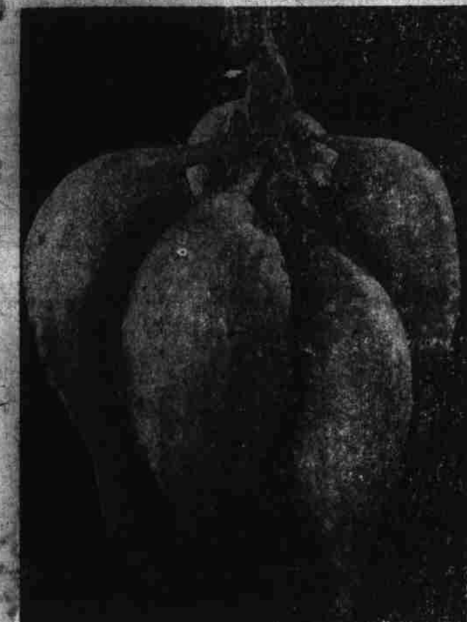
With money for advertising and promotion, leaders in the sweet potato industry say the future could be brighter for this long-time Tar Heel crop.

The 4-H Program is a great program for the youth in North Carolina and a most active program in Duplin County. Funds are to be used for increasing camping facilities to provide for the social, spiritual, physical and mental growth of the young people; aid with 4-H scholarship; recognition for 4-H club programs; and to help promote the International Farm Youth Exchange Program. 4-H has been a tremendous help to the boys and girls of Duplin.