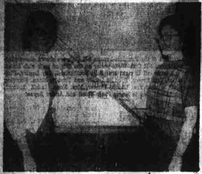
Two Oak Ridge 4-H girls are shown giving a demonstration of their monthly club meeting.