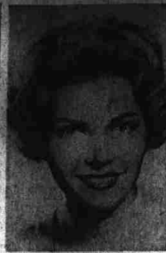
Whitney Blake Azalea Queen

WILMINGTON - Tall, blonde and blue-eyed Whitney Blake, who co-stars on the television show "Hazel", will be queen of the 1962 North Carolina Azalea Festival at Wilmington.