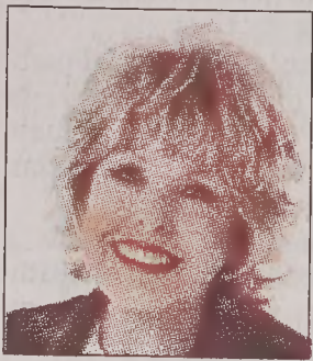
MARY HUNT Syndicated Columnist

These days, the typical wedding is anything but cheap. After all, for most people, it is one of the most important days of their lives. Still, finding ways to keep the costs down is a noble endeavor. Today's tips are among the best ever! I think that all you brides and grooms — and families who love them — will agree.