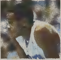
John Henson and the Tar Heels take down Kentucky.