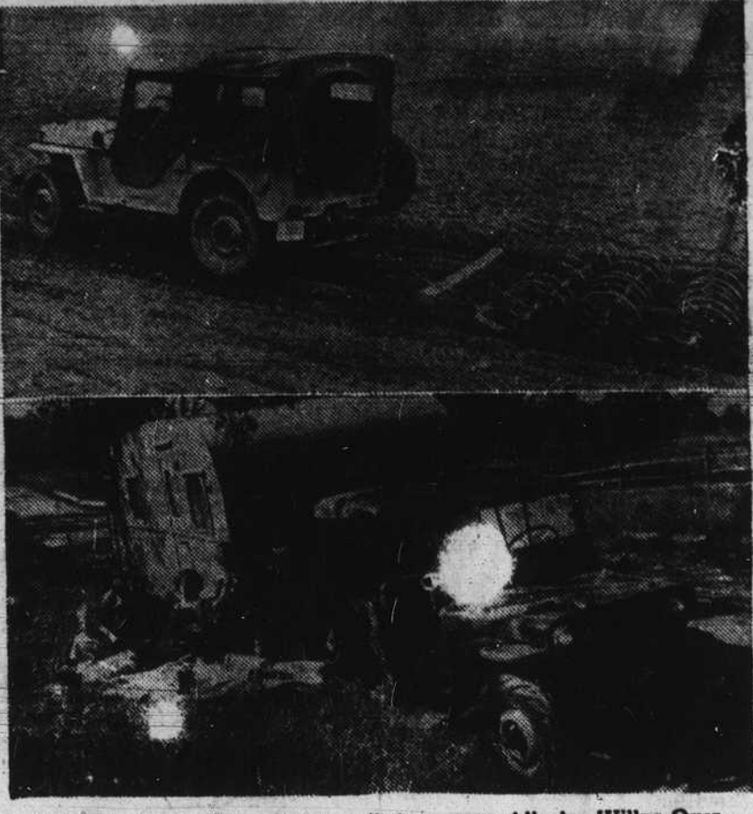
THE postwar Jeep, just unveiled to the public by Willys-Overland Motors, combines the four basic functions of tractor, light truck, mobile power unit and passenger conveyance. Photo at top shows the new Jeep pulling a spring tooth cultivator. Other farm applications include disking, mowing, raking, threshing, baling, shelling and grinding corn, operating manure spreader, filling silo, and sawing wood. Picture at bottom shows the new Jeep performing one of its less arduous tasks: taking the family on a picnic.