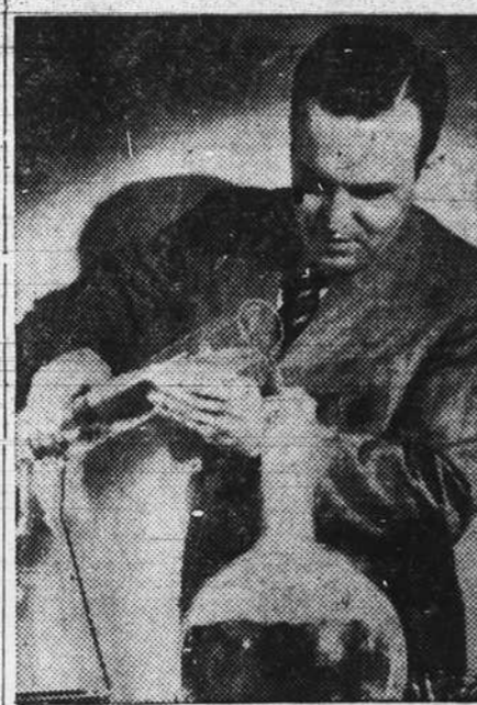
DR. IRWIN A. MOON

Full-color scenes from astronomy and natural science are featured in "The God of Creation," sound motion picture to be shown at 7:30 o'clock Monday evening, September 2, at a Union meeting of Eno Presbyterian Church and Cedar Grove Methodist Church.