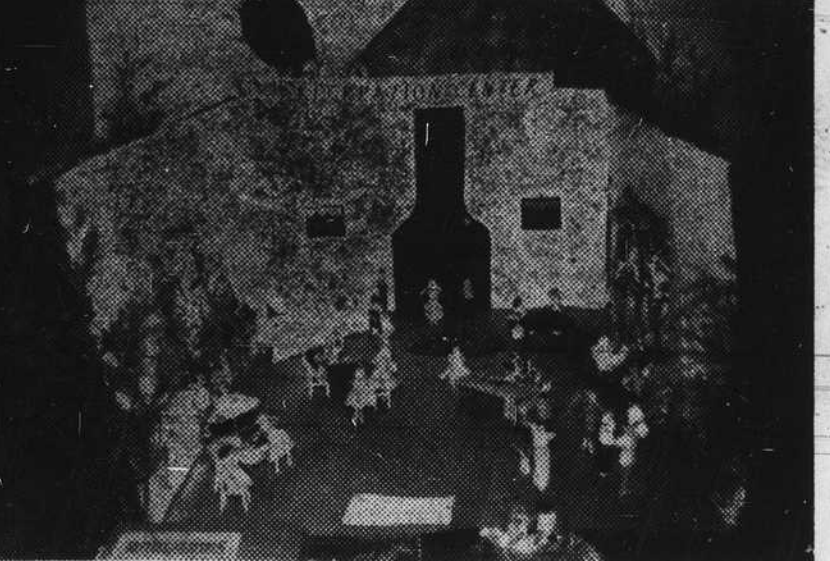
Recreation Center exhibited by the Schley club at annual meeting of county home demonstration clubs. Figures in the exhibit were made from clothespins.