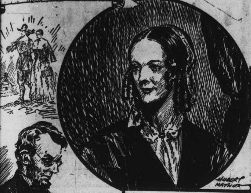
FOR 17 YEARS SHE WORKED TO HAVE A DAY OF THANKS SET ASIDE TO BE OBSERVED THROUGHOUT THE NATION.

HER GOAL WAS ATTAINED IN 1864 WHEN PRESIDENT LINCOLN ISSUED A PROCLAMATION ASKING "MY FELLOW-CITIZENS IN EVERY PART OF THE UNITED STATES... TO OBSERVE THE LAST THURSDAY OF NOVEMBER AS A DAY OF THANKSGIVING AND PRAISE..."