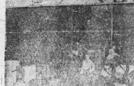
WHEAT GROWER Tom Campbell tells President Truman that rise in wheat price to $3.50 a bushel from current $3.00 could solve wheat shortage by encouraging farmers to turn loose grain they are holding.