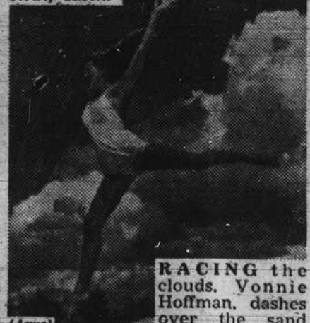
RACING the clouds, Yonnie Hoffman, dashes over the sand dunes at Panama City, Fla.