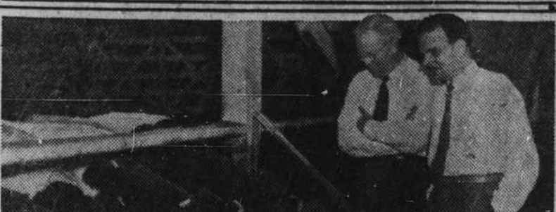
FARMER DEWEY explains some of the finer points of dairy cow husbandry to Republican vice presidential nominee Earl Warren during the California Governor's visit to Dewey's Pawling, N.Y., farm.