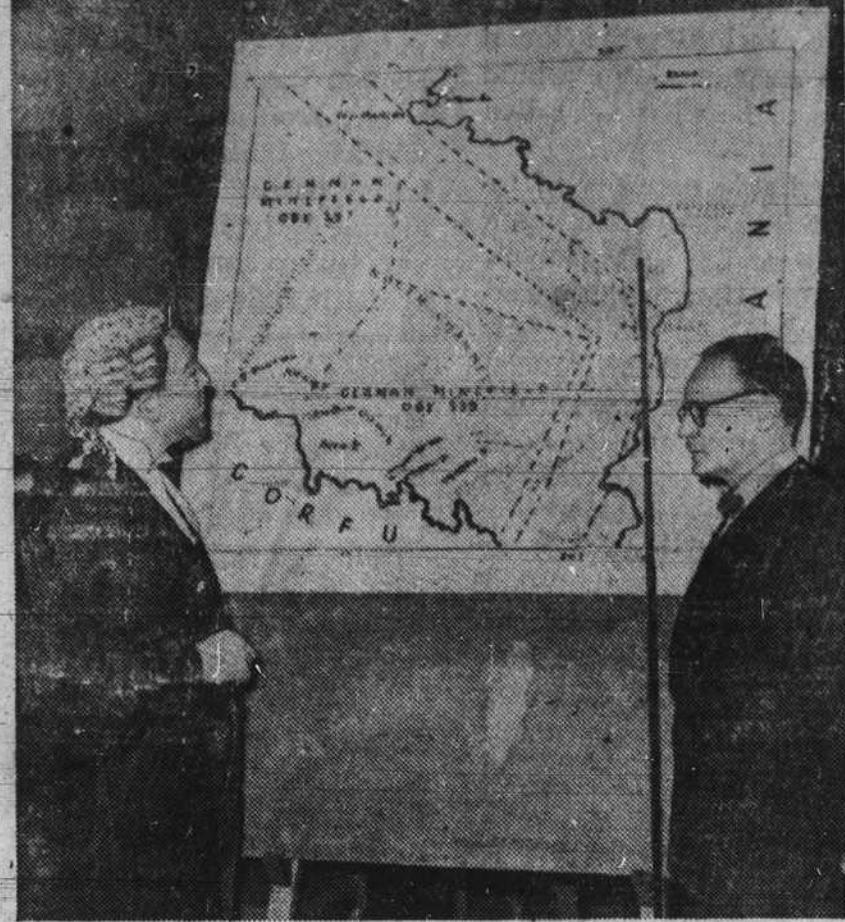
Arguments in the first case between nations to come before the International Court of Justice are now being heard at The Hague, The Netherlands. The case involves the United Kingdom's claims for payment from Albania as the result of mine damage to British destroyers and the death of 44 seamen in the Corfu Channel off the Albanian coast. Here Sir Hartley Shawcross (left), U.K. counsel, looks at a map of the channel with Pierre Cot, Albanian counsel.