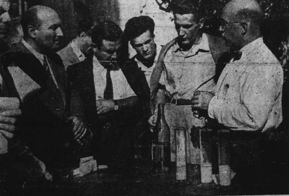
New ways of solving old problems are shown to experts and governments in dozens of countries through technical assistance programs of the United Nations and its affiliated specialized agencies. Here scientists in Italy learn about latest methods of central insect and fungi infestation in stored grains at a school conducted by the U.N. Food and Agriculture Organization (FAO).